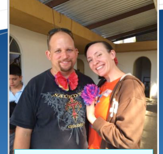
Paper bowtie and flower made at the mini carnival hosted by the team in January.

Since this transition has lessened the load of our weekly commitments, we have also begun leading other missionaries through this study as well that want to receive the same healing we have experienced as a result of the Celebrate Recovery program.